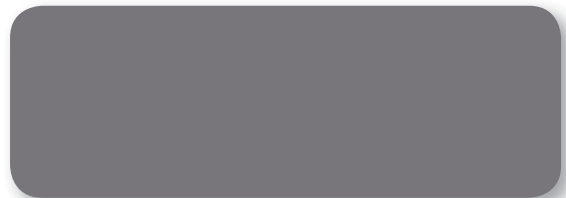
#109A Warm Grey